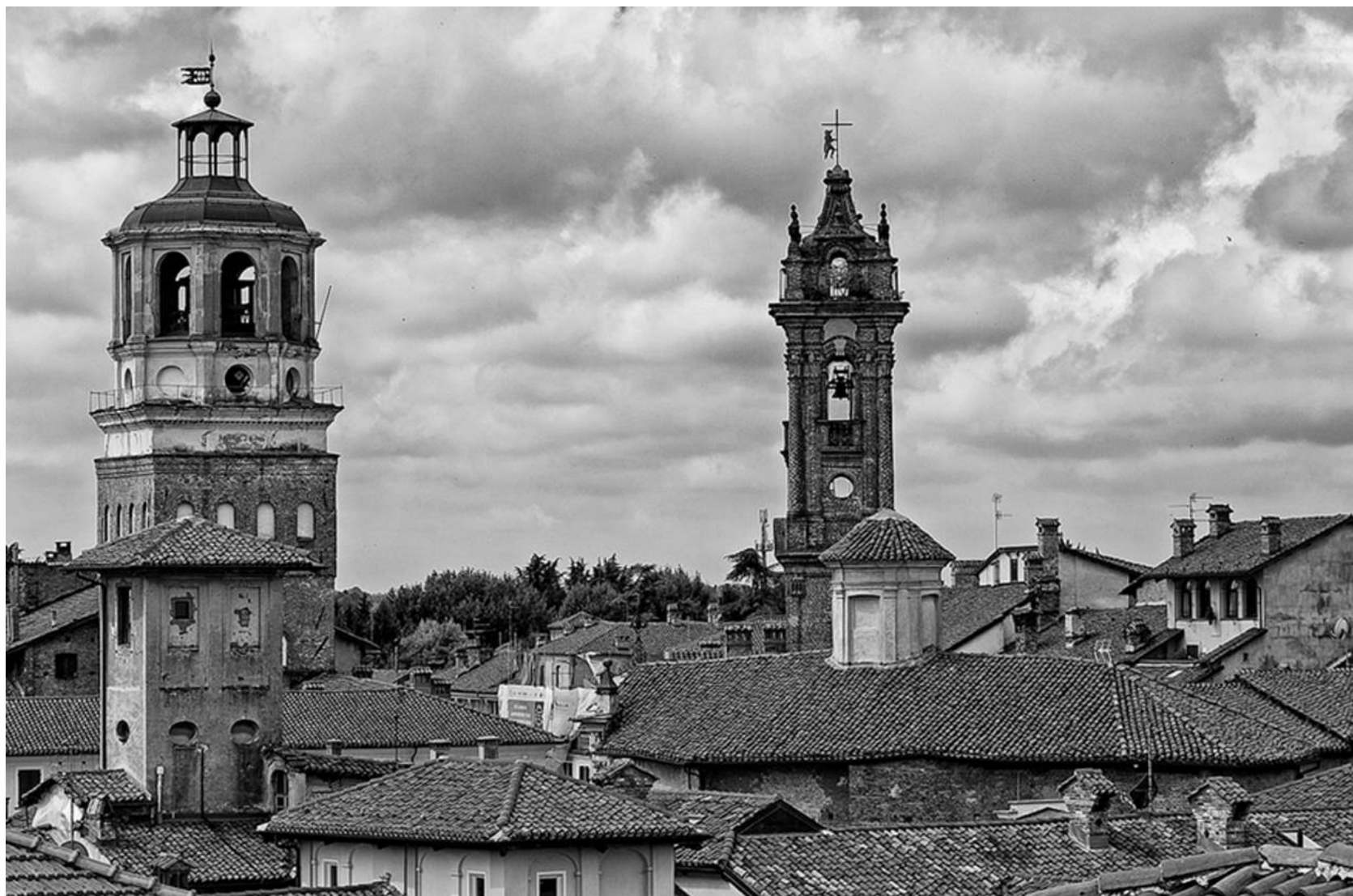
Fig. 6: Panoramic view of the historical centre of Savigliano with the civic tower in the piazza Santarosa.