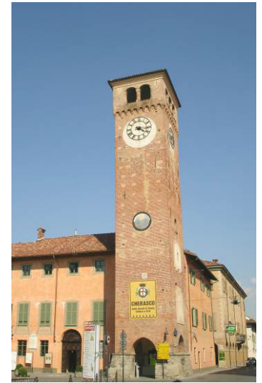
Fig. 8: Cherasco, civic tower.