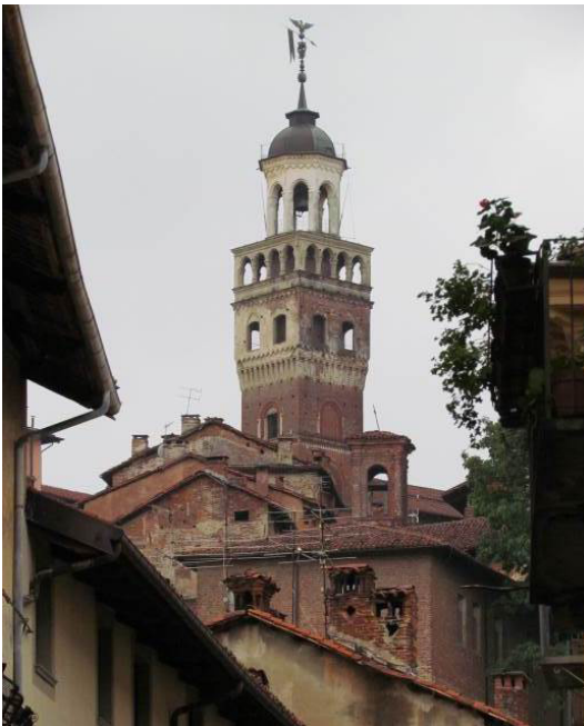
Fig. 10-11: Saluzzo, civic tower with municipal palace in Salita al castello.

in the final quarter of the 13th century, and these seem to suggest a plan for the expansion of the seats of communal power [Longhi 2010; Longhi 2011; Bonardi 2003]. Following are two case studies, of Savigliano and Cherasco, which still conserve their civic towers. The domus comunis of Savigliano has the oldest documentary attestation in south-western Piedmont, since 1224. Only in 1319 did the term palacium curie appear, currently used to indicate the seat of civic power. During the Angevin dominion, the palace remained the main place of civil power [Garzino, Olmo 1987]. The building is on the road intersection that joins the platea – central market area of the city – with the Sant'Andrea parish, ecclesiastical pole of the settlement expansion of the communal age. In the first two decades of the 13th century the platea was already established as a reference point for the municipality, which had convened its meetings in the church of Sant'Andrea (1205) and in the market (1217). The area in front of the town hall required a larger opening towards the platea , progressively saturated by the expansions of the housing complex of the Galatari family.