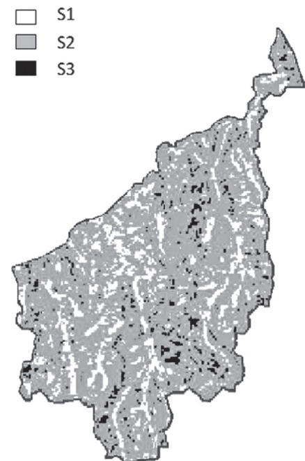
Fig. 3. Map of susceptibility to shallow landslides for the Cellio Municipality (VC). Classes of susceptibility: very low (S1), low/moderate (S2) and high (S3)

Using the ArcGIS software a susceptibility map was constructed, having identified three classes of susceptibility: S1, very low; S2, low/moderate (i.e. there are no evidences that the area is prone to landslide, but there are some unfavourable factors that make the triggering of a landslide conceivable); S3, high. The susceptibility map obtained is shown in Figure 3.