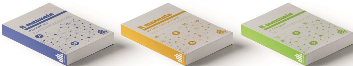
Figure 3. The three sections of the Home Handbook: Welcome Kit , Conscious Living and Your Home . (by Authors)

In its entirety, the main aim of the project is to guide the user to the spontaneous adoption of sustainable actions and behaviours, providing clear quantitative and qualitative information about the effects and benefits that can be obtained. It is important to note that each individual user will be strongly conditioned by additional factors: firstly, by their sensitivity to the subject of sustainability and current environmental and social challenges, and secondly by the possibility of tracing the behaviour suggested in others, in their neighbours, in their friends and even in the community to which they belong (Fogg, 2005). Although these factors are only partially controllable, the Home Handbook wants to convey a way of life and