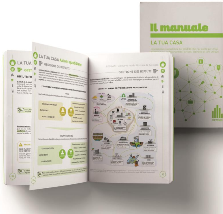
Figure 7. The pages of the Your Home book. In detail, the representation of the consequences and benefits generated by the different waste disposal methods chosen by the user. (by Authors)