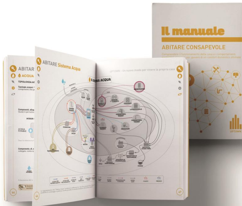
Figure 6. The pages of the Conscious Living book. In detail, an example of systemic representation aimed at communicating the Plumbing System in an Uptown Residence. (by Authors)

encouraging users to adopt sustainable behaviour is strengthened, by increasing awareness of the relationships between input and output within their living space.