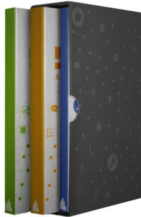
Figure 4. Home Handbook Slipcase designed for delivery to users. (by Authors)

living, rich in new and stronger values. Lastly, it aspires to lead users to a considerable level of wellbeing, achieved through the high quality of the social-physical spaces they inhabit (Bonnes and Secchiaroli, 1992; Bonnes and Carrus, 2004). This is why it is essential to preserve the perception of this quality, minimising the frustration caused by complex domestic problems and increasing opportunities for socialising, sharing and exchange in the belonging community 8 .