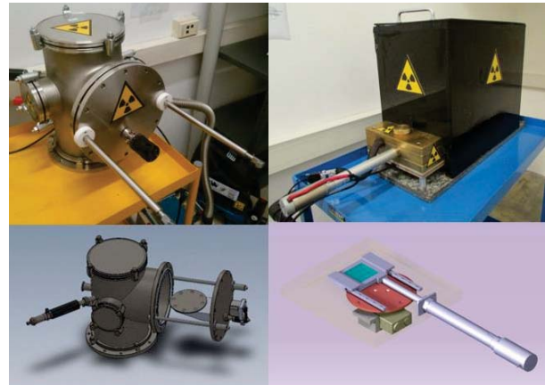
Fig. 1. On the left: \alpha irradiation system with the view of inner sample holder wheel. On the right: \beta irradiation system and its internal structure scheme.

A customised \alpha irradiation system (fig. 1) was designed, realized and optimised to evaluate the \alpha particles efficiency for each analysed object.