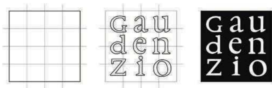
Fig.1. Design phases of the logotype.