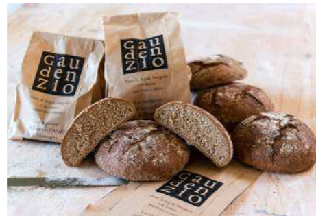
Fig.6. Traditional bread produced by the local bakery Il panificio di Varallo.