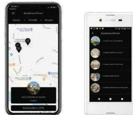
Fig.3. The App Gaudenzio downloadable from AppStore and Google Play Store.