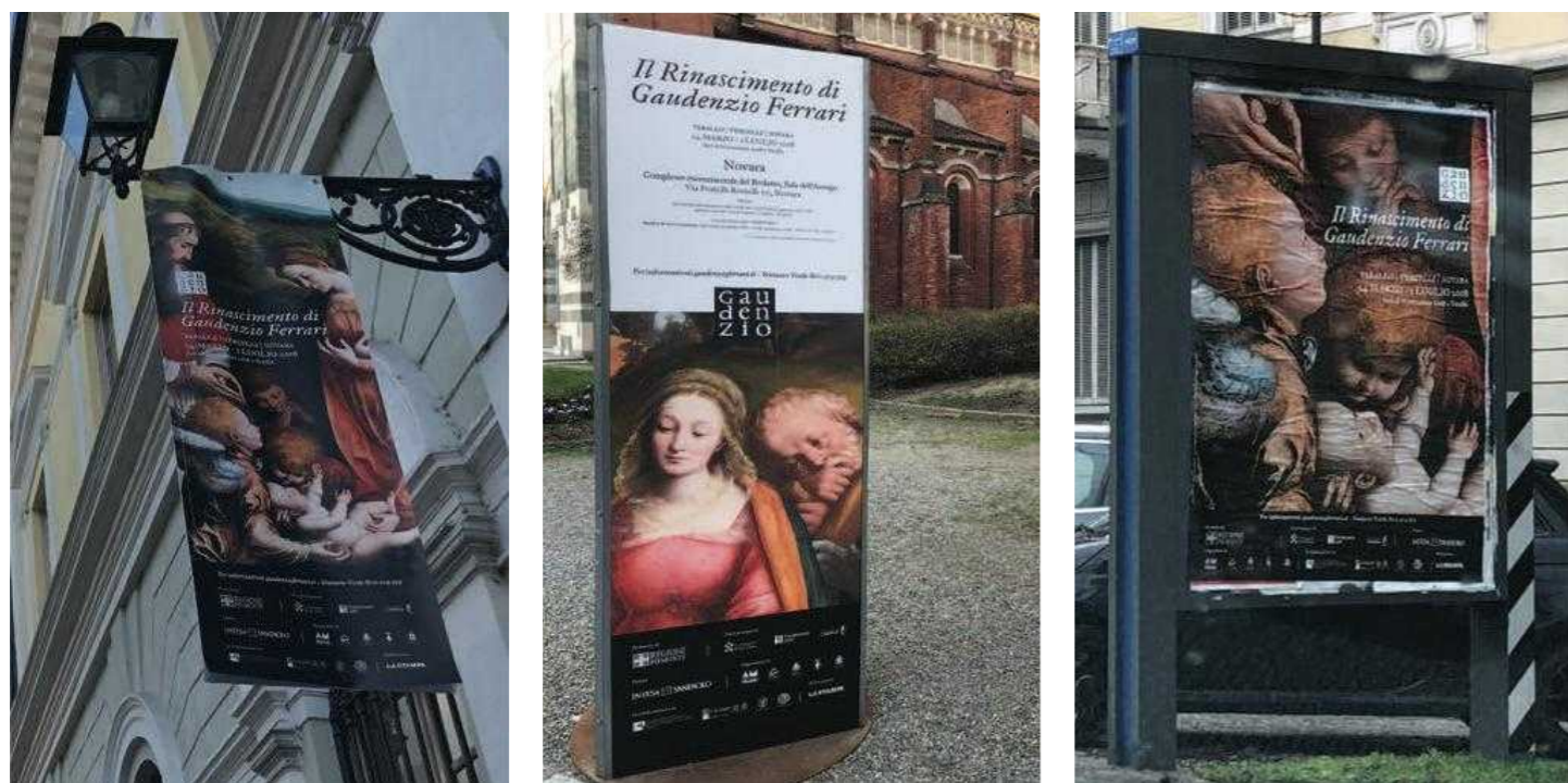
Fig.2. Visual advertisement of the diffused exhibition in Vercelli and in Torino, the regional capital.

In most cases, producers and sellers decided to maintain the logo after the conclusion of the event, transforming it into a permanent mark of their identity. As evidence of its popularity and effectiveness, it has also been introduced for the sign posting of local hiking trails supervised by CAI (Italian Alpine Club), and for the religious itineraries at Sacro Monte di Varallo (Fig.9). The municipality also decided to give visibility to their new and refreshed identity with a large painting at the entrance of the town (Fig.10). With respect to the advertising banners made of PVC, the local NGO Di.A.Psi. based in Vercelli - that supports individuals with mental illnesses and their families - had the great initiative to give them a second life; rather than being trashed, the banners underwent an upcycling process, utilizing local craftsmanship