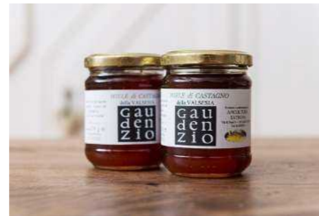
Fig.7. Honey from Apicoltura Sategna.