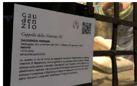
Fig.9. One of the explanatory plaques situated in front of a chapel at Sacro Monte di Varallo.