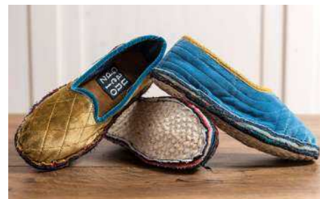
Fig.8. Scapin, a traditional local footwear, is realized in a special version as a tribute to Gaudenzio Ferrari.