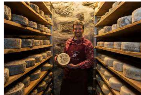
Fig.5. The producer Cerini Farm showing the Gaudentian toma.