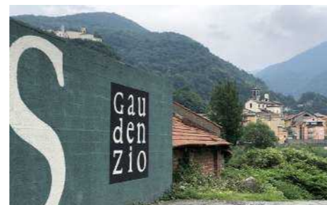
Fig.10. The large-scale reproduction of the logo Gaudenzio painted on a wall at the entrance of Varallo.

skills and becoming unique colourful bags and pencil cases. The products can be currently bought in local thrift shops. These signs are clear evidence that the exhibition has been a driving force for the enhancement of local activities and related economies, even if with limitations and, in some cases, limited results. These effects are qualitatively important to accentuate the sense of belonging of the citizens to the entire process, the cooperative atmosphere between those who participated, and the perception of unity. The long-term goal revolves around the will of perpetuating these feelings and positive vibes, even after the temporal and spatial end of the exhibition.