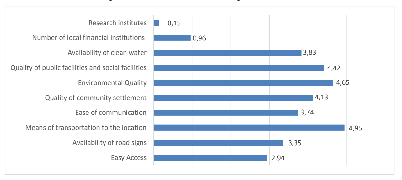
Figure 2. Location Factors Leverage Index Value