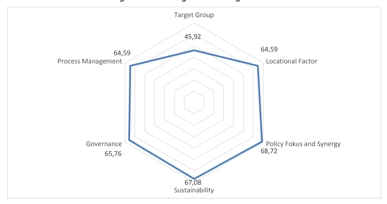
Figure 7. Kite Diagram of Hexagon RALED.

The development of the local economy requires the right strategy in the implementation of the development of the tourism potential of Bumi Perkemahan Bedengan. This strategy aims to optimize the development of a tourism-based local economy at the Bumi Perkemahan Bedengan. The determination of the status of local economic development aims to determine the general condition of local economic development in the region. From the six aspects of the kite diagram, it can be illustrated that the point farther away from point 0 is the best value or indicates a very good condition of local economic development. This means that the application of the concept of local economic development is said to be successful. The results of the study are presented in Figure 7.