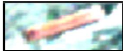
Figure 7: Third Image to Evaluate.

In image 6, a ship is presented on the high seas, unlike the image in figure 5, it does not show the reflection of light in the waters of the sea.