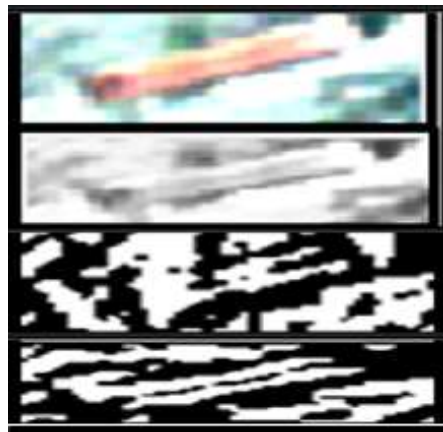
Figure 12: Results of the Third Image.

In image 11, the result of processing the second image is presented, in this particular case the best result is processing the image with GX sobel, compared to the GY sobel image.