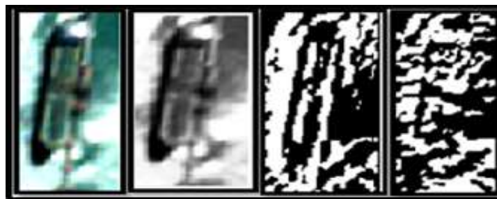
Figure 10: Results of the First Image.

Figure 8 shows the detail of the images to be analyzed, with their respective convolution mask, and image 9 shows the result of applying the edge detectors for the gradient in X and the gradient in Y, with their respective degrees of effectiveness indicating the percentage of edges found, with this analysis you can choose the best option to use edge detectors.