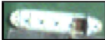
Figure 6: Second Image to Evaluate.

In image 5, the image of a ship on the high seas is observed, the level of detail of the image is poor, and it is a characteristic of satellite images, when trying to observe the content of the image with a higher level of detail satellite. The background of the image is presented brilliantly by the reflection of sunlight in the sea, this will be one of the main problems when detecting the edges.