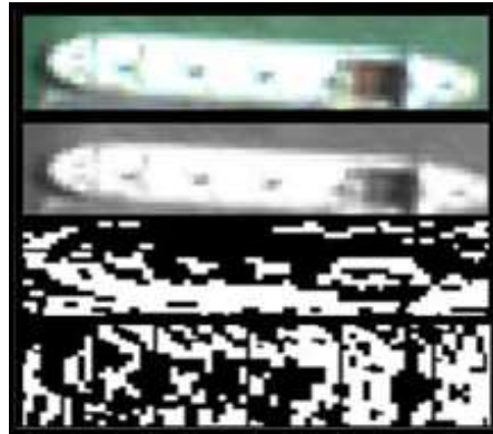
Figure 11: Results of the Second Image.

Image 10 shows the results of the first image of the ship, where the four processing stages are, first the original image, second the grayscale image, third the image with GY sobel and fourth the image with GX sobel, in this particular case the result that best demonstrates the edges is with the use of GY sobel, in the case of GX sobel the resulting image does not indicate the edges of the boat image.