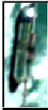
Figure 5: First Image to Evaluate.

In image 5, the image of a ship on the high seas is observed, the level of detail of the image is poor, and it is a characteristic of satellite images, when trying to observe the content of the image with a higher level of detail satellite. The background of the image is presented brilliantly by the reflection of sunlight in the sea, this will be one of the main problems when detecting the edges.