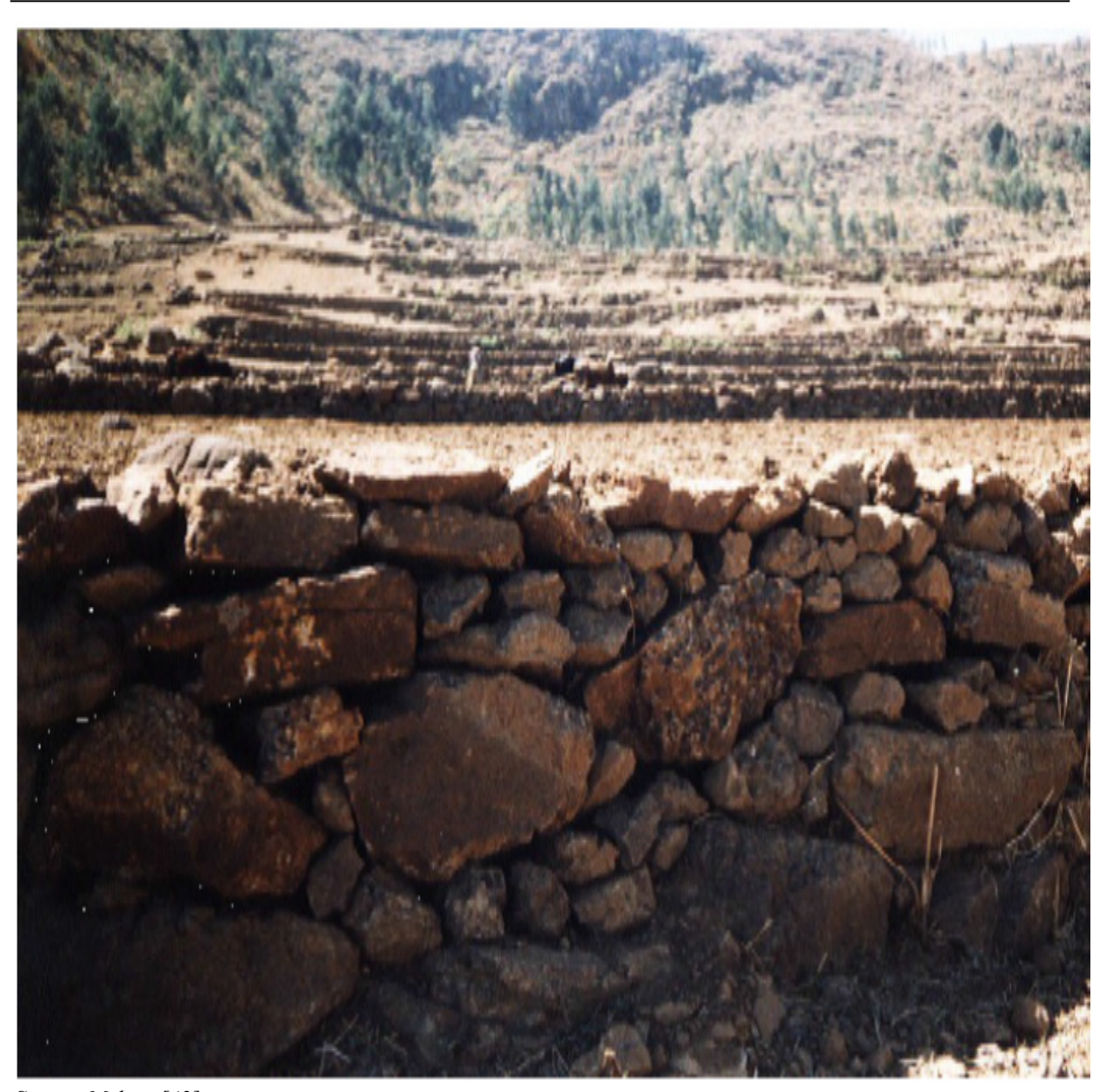
Source: Melese [42] Figure 6: Stone bund constructed in Afama Bancha Kebele (SNNPR, Ethiopia)