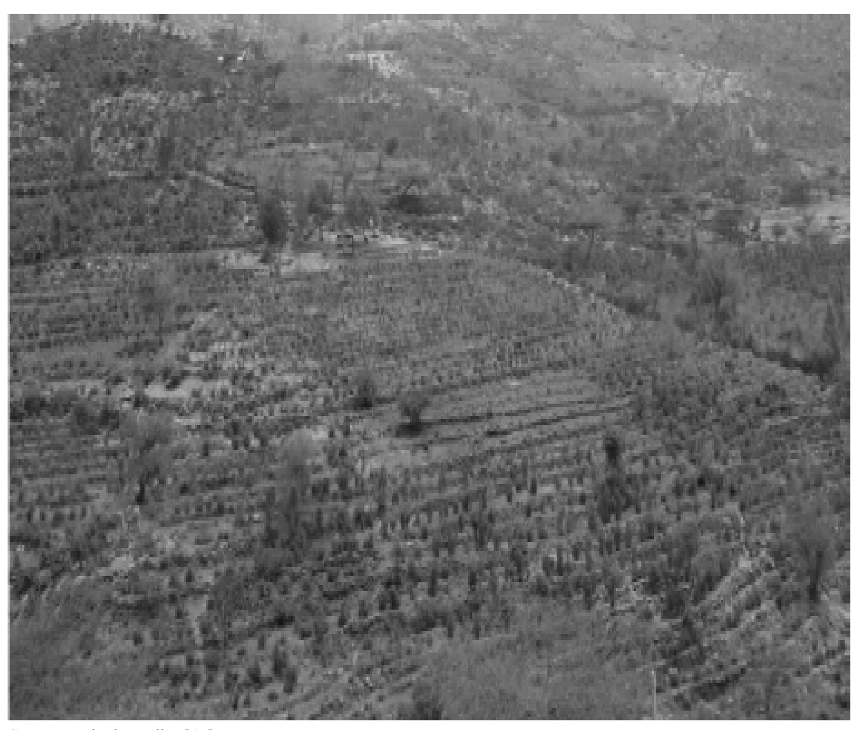
Figure 3: Stone Bunds in Harerghe, Dire Dewa Watershed