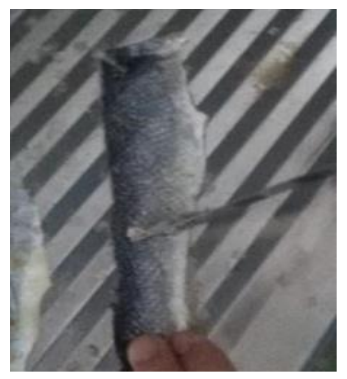
Figure 1. Removal of fish scale (descaling)

The fish skin was preserved by dry salted conservation method. Scales were removed from the body of fish in a careless technique. Then the fish skins are processed by a traditional method turning to crust fish leather, see Figure 1.