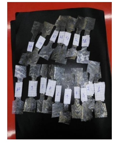
Figure 2. Shape of the fish test pieces for tensile testing

By using Vernier caliper, we have measured the width of each test piece at three positions on the grain and flash side. Then is measured the thickness in three position in accordance with ISO 2589:2016 [10]. After this samples were taken to check the tensile strength. The samples were clamped in the jaws of the tensile apparatus keeping the jaw in a distance of 50 mm apart. The machine is operated until the test piece is broken and the highest force exerted as the breaking force. The tensile strength (Tn) shall be calculated, in Newtons per square millimeter. Tensile strength, Tn (in Newton per square millimeter) is calculated, using equation (1):