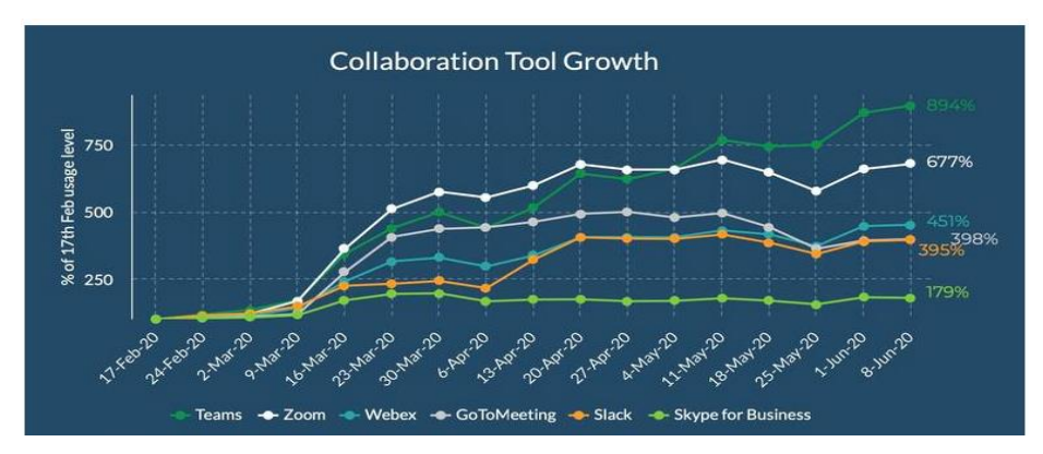
Fig. 1. Percentage growth in collaboration tools, 17th Feb to 14th June 2020 (TechRepublic, 2020)

According to the ARC report, the "Global E-Learning market is expected to grow from $176.12 billion in 2017 to reach $398.15 billion by 2026 with a CAGR of 9.5%" (Pande, 2021). Some of the basic key factors having a positive impact in growth and use are such as the possibility of flexibility in learning, lower costs, accessibility, virtual environment learning, and the ability to use various online capabilities such as laptops, desktops, phones, tablets etc., however, other factors may have a set-back such as change management, lack of latest technology, partnerships are some of the issues that may hinder the growth of this market (Pande, 2021).