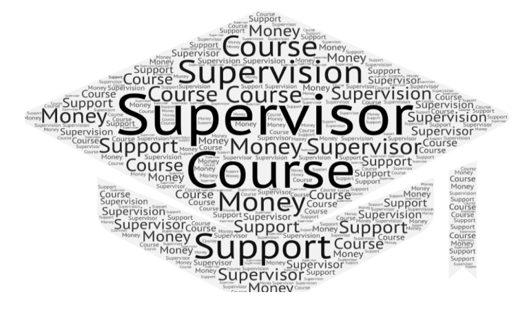
Figure 3. Cloud of words

From the above, we can infer that the presence of the supervisor is important in thesis development and therefore there is a significant relationship between the supervisor and thesis development (Bayona, 2018) besides gratitude (Howells et al., 2017). A cloud of words (Figure 3) shows the need for improvements based on the perception of the respondents, who highlight the need for a supervisor, improve the supervision process and courses related to thesis development.