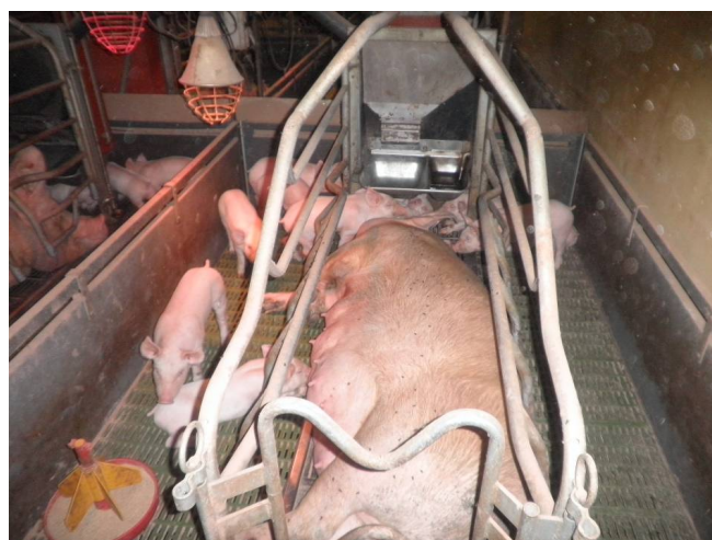
Fig. 3. Pen for farrowing sows and keeping suckling pigs with additional feeding in the feeder (I-TEK company)

The conditions for keeping sows and suckling piglets were provided with equipment, farrowing pens, a ventilation system, feed transportation, and feeding manure removal in building No. 3 – the French manufacturer I-TEK (Fig. 3).