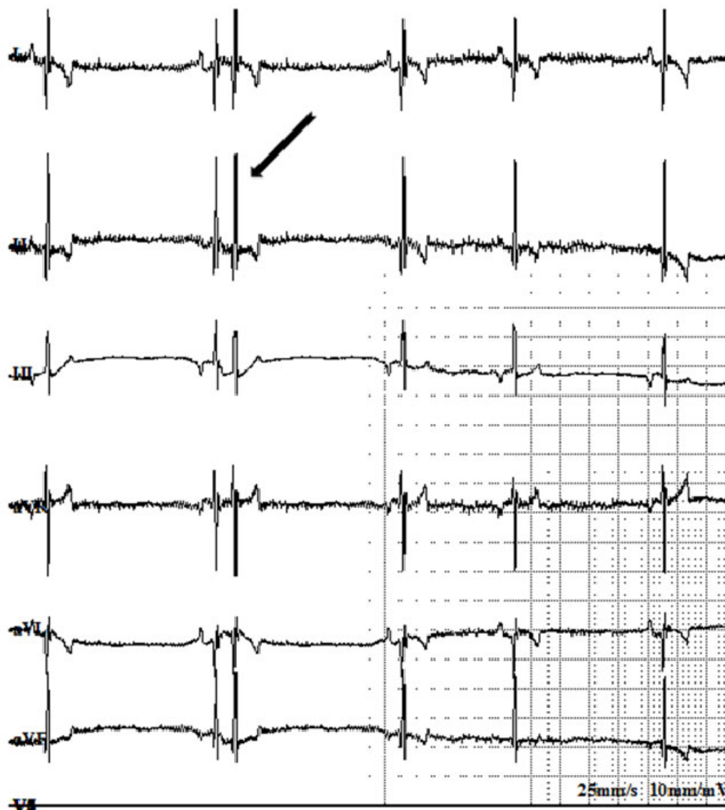
Fig. 1. Electrocardiography of the heart of a spaniel dog. Ectopic contraction. Supraventricular extrasystole

Echocardiographic examination of all dogs showed an increase in the ratio of LP/Ao, which indicates the presence of a tria dilation, which is characteristic of patients with this stage of heart failure. After treatment, there was a slight decrease in the ratio of LP/Ao. The positive effect of the drug is associated with increased myocardial contractile function and decreased postload (positive inotropic and vasodilating effect of bendamine). After all, a decrease in pressure in the left ventricle leads to a decrease in pressure in the left atrium and pulmonary veins.