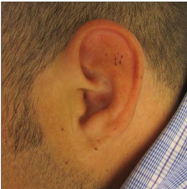
FIGURE 1. Erythema and swelling of the auricle of the left ear with notable sparing of the earlobe.

Relapsing polychondritis is an uncommon progressive disease characterized by recurrent inflammatory insults to cartilaginous and proteoglycan-rich structures. 4 The most