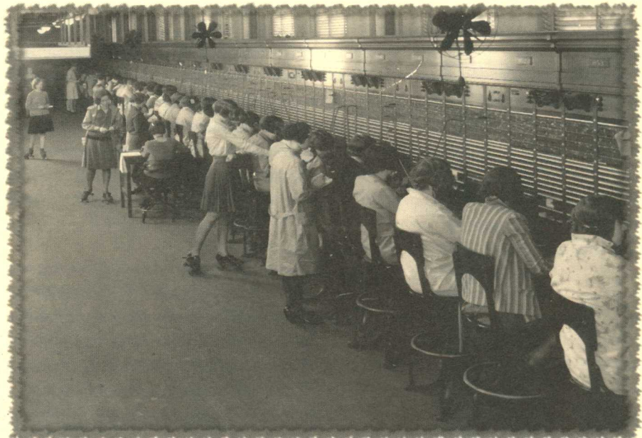
Chicago-based Ameritech today uses computerized switching to speed the connection of phone calls. In 1929, Illinois Bell, a predecessor company, used messengers on roller skates and switchboard operators to handle this function.