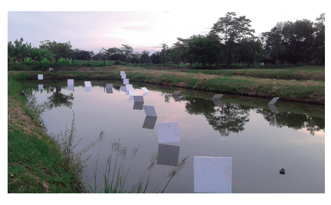
Figure 1. Artificial pond at Universidad de los Llanos where the experiments using Noctilio albiventris were done. In the image is shown the situation using the highest density of obstacles.