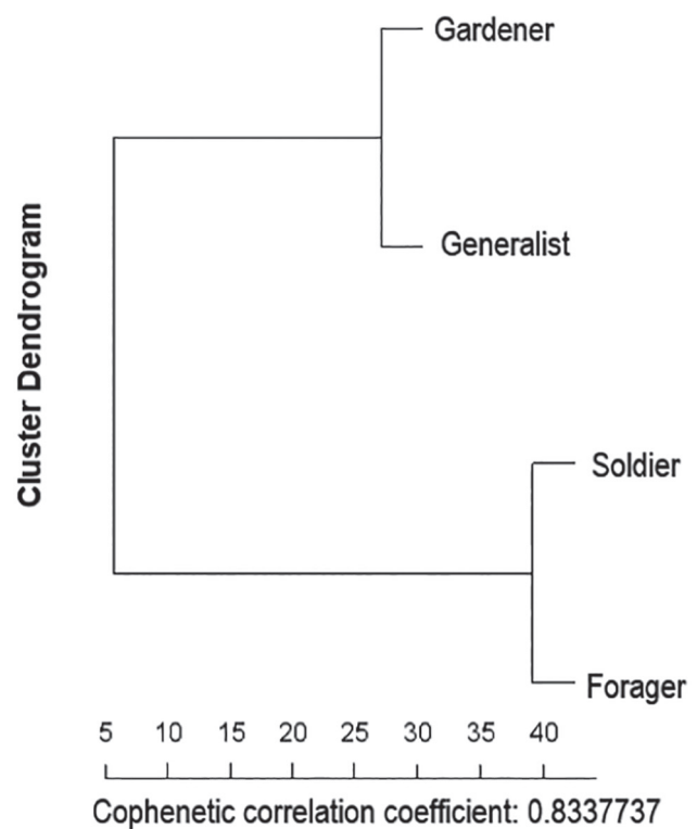
Figure 3. Similarity dendrogram based on the similarities and dissimilarities of the cuticular chemical compositions of the subcastes of the ant Atta laevigata based on the data obtained by CG-MS. Cophenetic Correlation Coefficient = 0.76.

The cluster analysis (Fig. 3) indicates that the composition of the cuticle is related to the type of task and environmental factors which subcastes are submitted to according to the function the workers perform, and since the groupings between ants that spend more time outside the nest, have cuticle composition closer than those that perform tasks inside the nest. Indeed, behavioral studies with leaf-cutting ants show that foragers and soldiers of the genus Atta spend more time performing tasks outside the nest than gardeners and generalists (Hölldobler & Wilson, 2010).