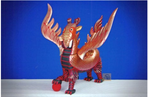
Figure 2: "Pha-ya Luang" and "Tuk-ga-ta-pha-ya luang" used in community cultural events.