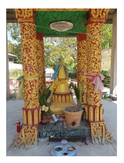
Figure 1: The central pillar of Ban Meuang Luang, which was rebuilt with reference to the original. It has an inscription that reads, "the pillar of the heart of the house, home set up on Saturday 3 April 1932."