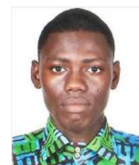
(✉ Corresponding Author)

Georgina Lala Ehemba 1 Yedomon Ange Bovys Zoclanclounon 2 ✉ Moustapha Gueye 3 Cyril Diatta 4 Martial Barnabe Etienne Diatta 5 Cheikh Thiaw 6 Alfred Kouly Tine 7 Alpha Bocar Baldé 8 Ghislain Kanfany 9