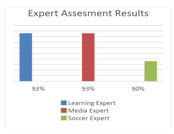
Figure 1. Assessments

The results of the assessments from 3 experts, namely learning experts, media experts and soccer experts can be seen in Figure 1 as follows: