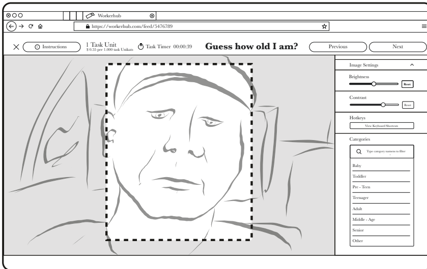
Fig. 2. Age-based classification of images on Workerhub's interface.