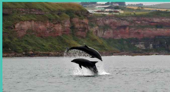
Image 2: Bottlenose dolphins off the Berwickshire Coast.

Landowners can work with organisations like NatureScot to minimise the pressures on designated sites through proper management. NatureScot's site condition monitoring practices are undergoing improvements to ensure connectivity with other habitats and surveillance work which considers interactions between habitats. This is crucial as biodiversity targets are not just focused on species health, but also ecosystem connectivity.