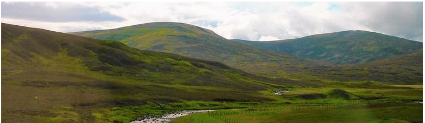
Image 6: Image taken in the Cairngorms National Park