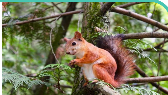
Image 3: Red squirrels are native to Scotland and protected by the Wildlife and Countryside Act 1981 (as amended).