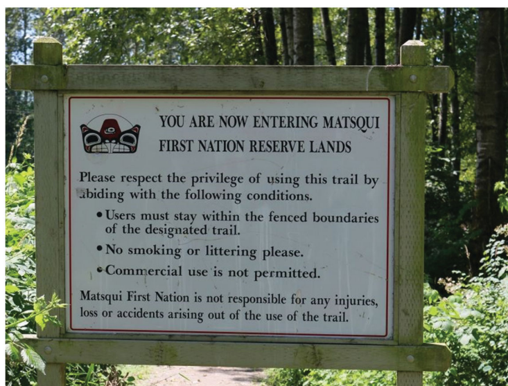
Figure 2. Matsqui Trail Regional Park.

that provincial laws and municipal bylaws ought not to stretch inside a reserve's space, although some exceptions are made where a provincial law is of "general application" and a Band Council has not made decisions in relation to that policy area (Figure 2). 56