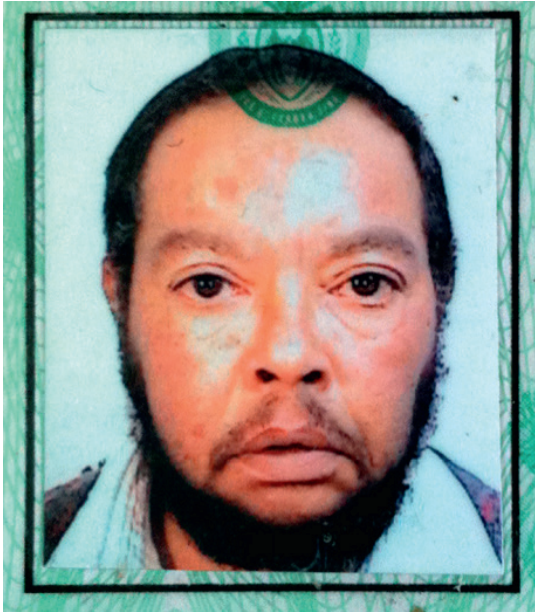
Figure 2 Charl, ID Photograph . nd.; Analogue Photograph.

override other (textual) information – the photograph becomes shorthand for gender status in the format of this document, as it is seemingly read as one of the most obvious signs of a gender identity. It is, however, only with his current identity document where his photograph, name and number correspond to his experienced gender identity, that his status as a man (instead of a trans person) is consistently read as such and officially reiterated in the public arena.