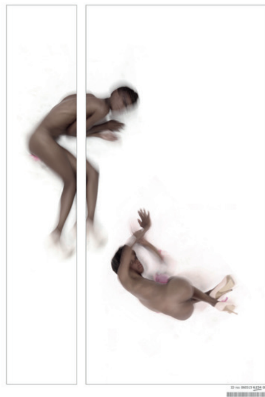
Figure 5 Robert Hamblin, Kim , 2011. Digital Photograph.