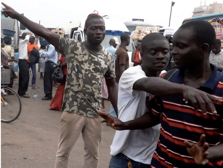
Competing for an incoming passenger

high number of shadows working at the Neoplan Station is indicative of the equally constant high number of novice travellers coming to its yard.