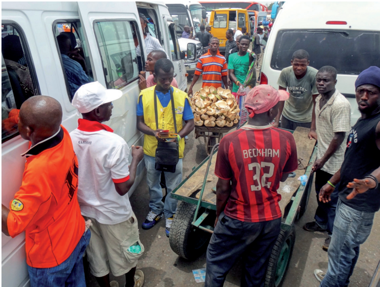
In the thrust of floor activities

societies. 3 While they are framed, and licenced, by these larger associations, regarding their respective business practices ‘on the floor’, each branch represents a virtually independent enterprise; an independence which in turn lays the ground for the stiff competition for passengers they are engaged in with each other, and often also within each one of them. For, out of its 34 destinations, 19 are served by only one branch, while the passengers for the remaining 15 destinations are fought over by at least two different branches, with the cars plying to Kumasi being in the toughest scramble, as this most important route is served by altogether four of Neoplan’s branches.