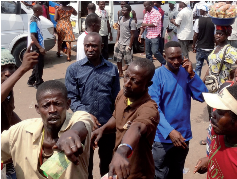
Hustling for passengers

selling points who regularly sweep the floor where the coaches are parked. However, these codes are restricted to particular, spatially-confined areas within the yard, and even there executed only in patches. In this sense, the itinerant preacher can opt for preaching in other busses (or at another station), while the saleswomen is free to change her location or resort to hawking.