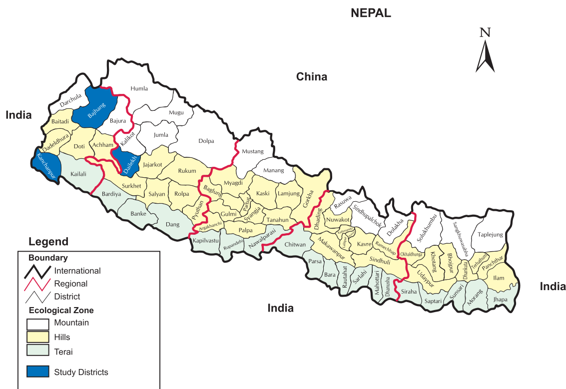
Figure 1. Map of Nepal showing the study districts Bajhang, Dailekh and Kanchanpur in the mid- and far- western Nepal.

Study participants were women who gave birth to a live baby within the 12 months immediately preceding the survey.