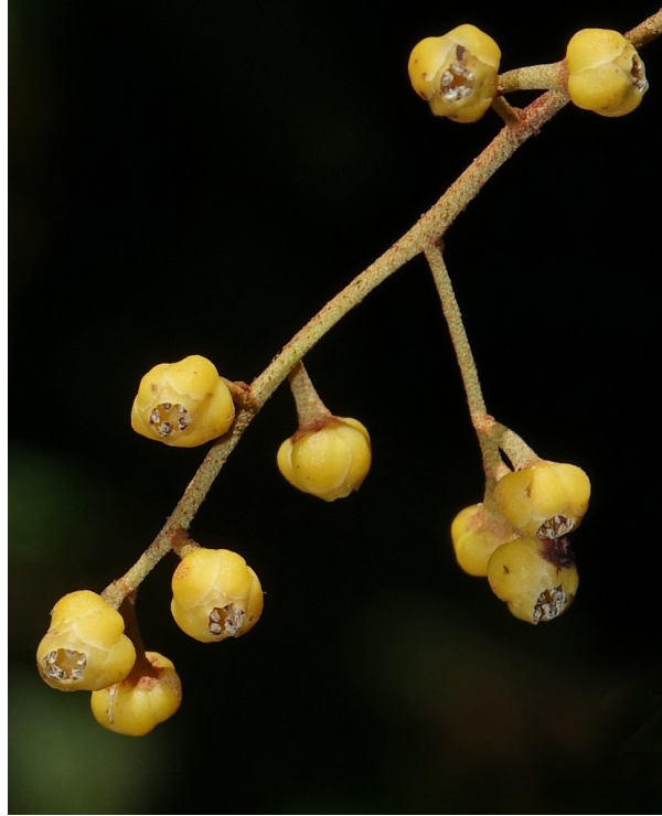
Fig. 2. Aglaia monticola flowers. (Cooper 2694 & Morris, CNS).