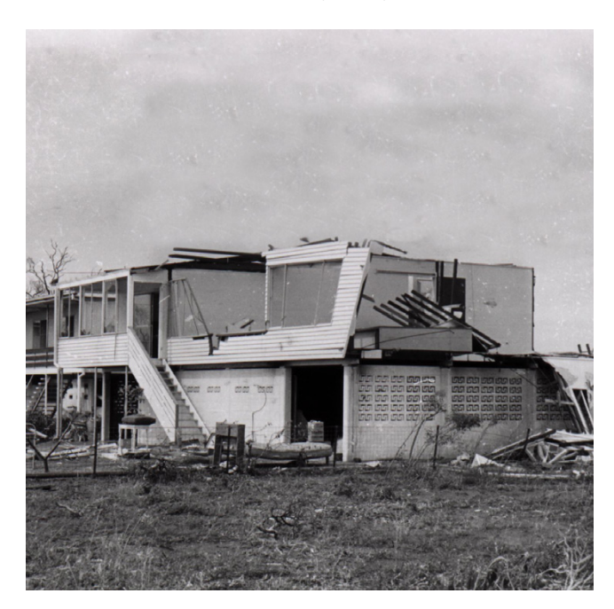
Severe Tropical Cyclone Althea devastated parts of North Queensland just before Christmas 1971 and was one of the strongest storms ever to affect the Townsville area.

The research from major disasters in the early- and mid-1970s reflects the work of both engineers and geographers. After the formalisation of the CTS in 1977, separate engineering, structural impact assessments and wind-load reports were produced and are published on the university's website. The studies listed in Table 1 were carried out in the days and weeks immediately following a disaster. Most of the studies are recorded in research reports that were provided to emergency managers and stakeholders at debriefing meetings. Some studies formed part of higher-degree research and are contained within theses. Many of the immediate post-disaster studies have been incorporated into academic journal articles and book chapters, often analysed in conjunction with other disasters and related to other literature (Oliver 1980). Given that most early studies only exist in hard copy format, Table 1 lists studies that can be tracked down and a publication identified. Most of the paper-based publications and associated grey literature developed before the 1990s is held by the CDS and James Cook University library.<sup>2</sup>