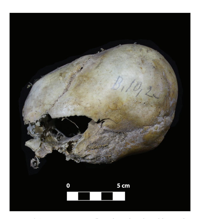
Figure 5. Specimen N. 3037 (lateral view) with visible annular modification. The neurocranium is elongated anteroposteriorly. The facial skeleton is missing.

In Eurasia and Africa, other populations have practiced cranial modification (31); however, this was common in pre-Hispanic Meso and South America (12, 13, 32). Our results show that most of the skulls collected were modified (77% of the 370 specimens are