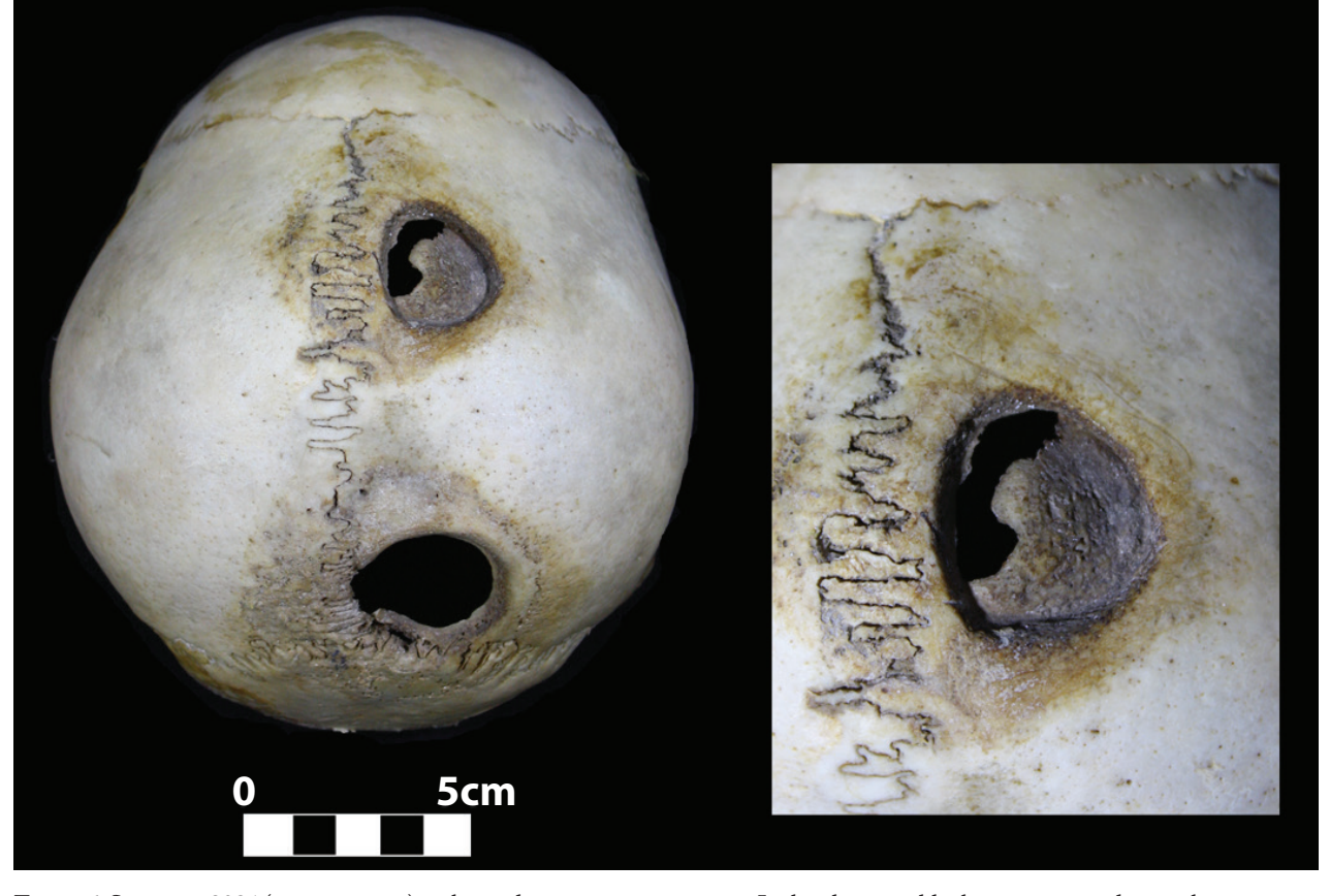
Figure 6. Specimen 3084 (posterior view) with circular grooving trepanation. In detail, it is visible the trepanation close to the osteometric point Bregma. This trepanation did not completely remove the inner table of the diploe, and cut-marks are visible on the margins.

be related to different causal factors - not mutually exclusive. One of these could be related to warfare since the Inca Empire expanded in a relatively short timeframe, and this expansion was accompanied by many wars and battles (1, 3-5, 36). The high occurrence of trepanation events could be related to an increased frequency of cranial traumas probably treated through trepanation and cleaning of the wounds. The surgeons became experts in treating these traumas via trepanation, which is also evident by the high survival rate they accomplished. This hypothesis is also supported by the position and side of the cranial defect, which in this sample are located on the cranial vault (frontal and parietal bones). This hypothesis agrees with the results of the analysis of the archeological sample excavated in Cuzco (4). Further, more profound knowledge of neurosurgical techniques might have allowed this kind of intervention to be carried out more frequently than in other populations.