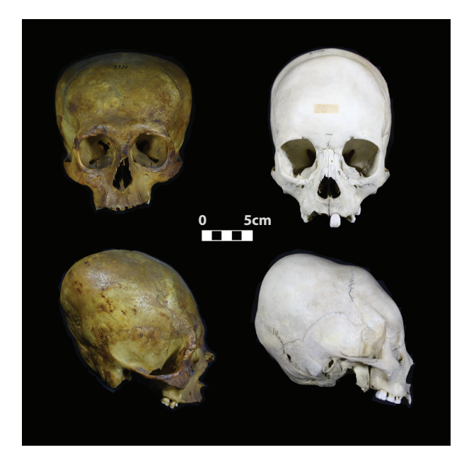
Figure 2. Types of cranial modification. Left tabular type (Cat. N. 2271), right annular type (Cat. N. 6153).

Among the whole sample of skulls, sex distribution was as follows: from Lima, 165 belonged to males, 79 to females, and 31 to undetermined sex; from Cuzco: 16 to males, 21 to females, and 11 were undetermined. When considering the modified skulls from Lima: 127