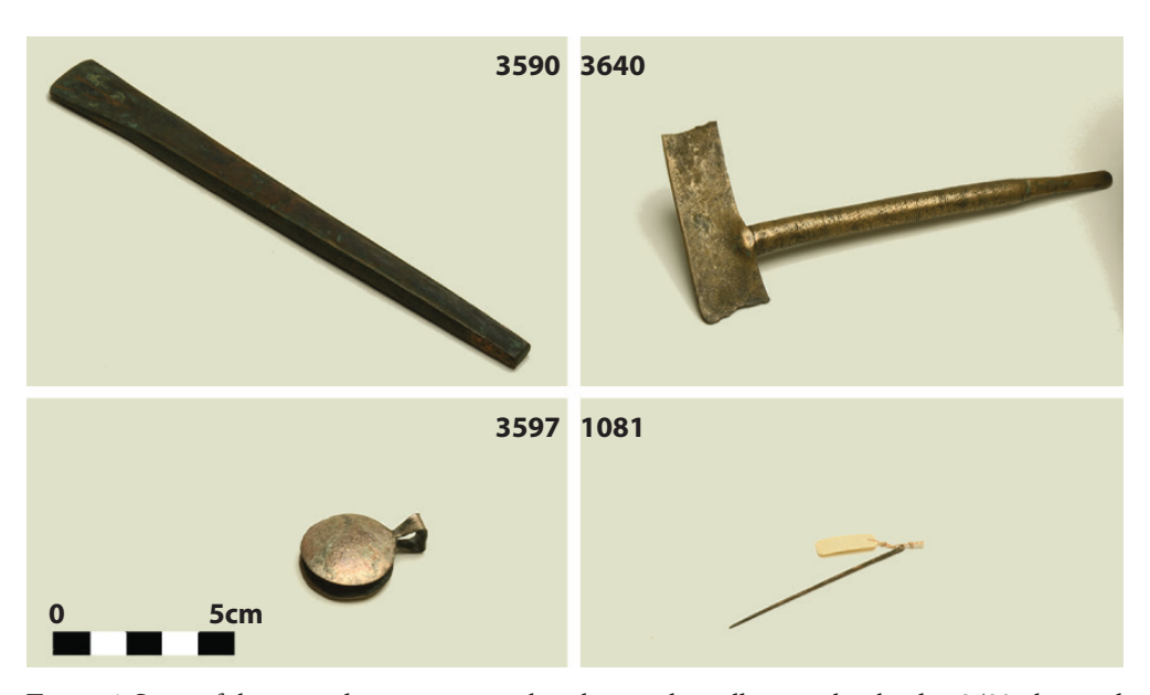
Figure 4. Some of the surgical instruments in the ethnographic collection: the chisel n. 3590, the ritual knife n. 3604, the tweezer n. 3597 (copper and silver alloy) and the needle n. 1081. All these instruments belong to the Mazzei collection.

specialized professionals was needed to achieve these results. The modification process must have begun immediately after birth since cranial sutures are still open at this ontogenetic stage, and the bone could be easily modified. The extreme modification could have been achieved only when the deformative process began in the first years of life. For instance, specimen N 3037 (Fig. 5) is an infant with an estimated age of around 6 to 12 months that already shows a completely modified neurocranium.