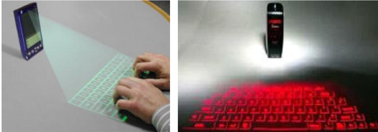
Figure 3. DOE Diffractive effects examples - DEIS Department University of Bologna (Italy)