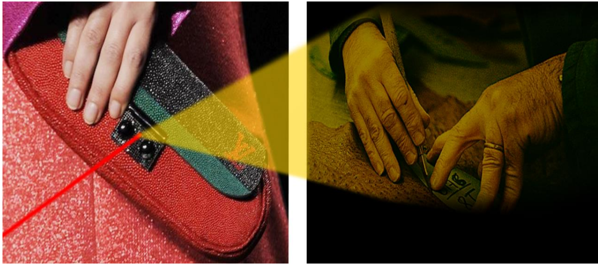
Figure 3. Dffractive effect by reflection due of an external laser source – application on a metal component of fashion accessory – REllab DIDA Department University of Florence

diffractive methods could highlight the intrinsic attitude of SMEs in technology transfer and cross fertilization applications.