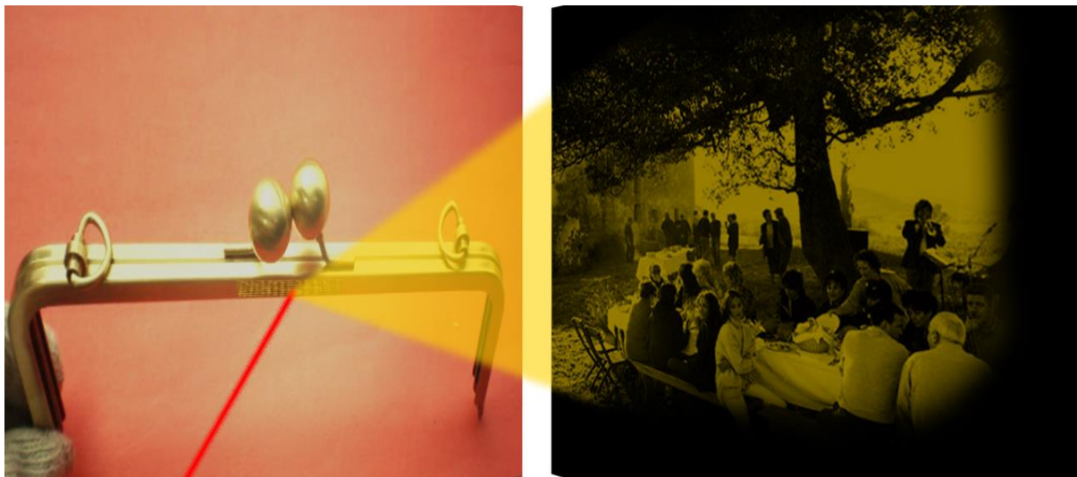
Figure 4. Dffractive effect by reflection due of an external laser source – application on a metal component of fashion accessory – REllab DIDA Department University of Florence