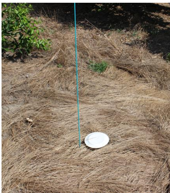
Figure 1. Illustration showing the installation of pitfall traps

A plastic cup with a diameter and height of 90 mm and 120 mm was embedded in the ground and filled with 100 ml of 70% ethanol to exterminate and preserve the captured insects. Figure 1 illustrates the installation of an 18 cm diameter paper plate over the trap, as a rain shield. Subsequently, five traps were set in each plot and recovered after a week to identify the species of the captured ground-dwelling arthropods and estimate their populations. These devices were set up seven times on April 28, May 23, June 28, July 21, August 21, September 29 and October 30, 2017.