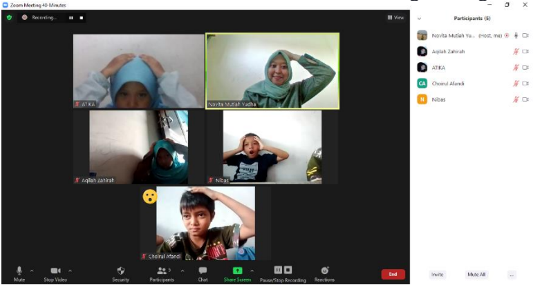
Figure 1 The students follow the researcher on learning through zoom