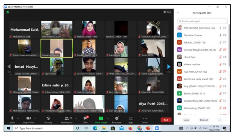
Figure 5. Closing session in the webinar class (zoom)