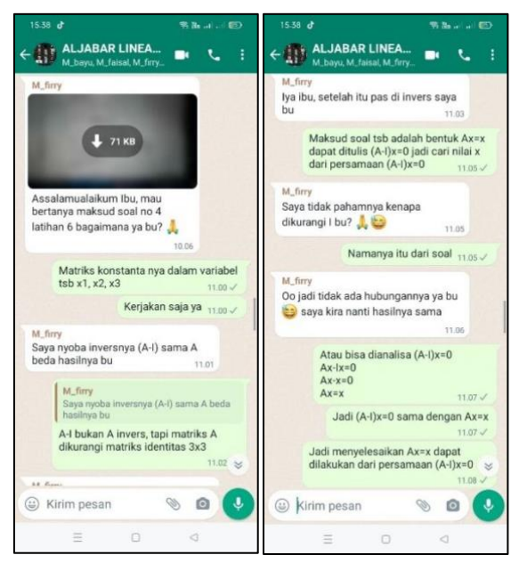
Figure 6. Discussion session in WAG

The first meeting was conducted asynchronously through e-learning classes with preservice teachers observed to have filled the attendance lists, accessed contents, studied teaching materials,