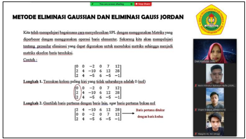
Figure 4. Discussion session in the webinar class (zoom)