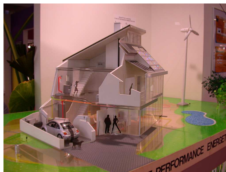
Figure i : The Ener+ house small scale model.

The Energy Positive House Ener+ The energy positive house Ener+ project 1 described technically in (21), aims to design a family size house, represented in Figure i, connected to the electricity grid that will produce enough energy to meet at least its own consumption 2 . A complete numeric model of the target house was set up in TRNSYS with 14 temperature zones in the Type56 description (22). Several scenario were ran for a location in Lyon-France where the climate is temperate and sunny 3 . The weather data input were from Typical Meteorological Year statistical hourly values.