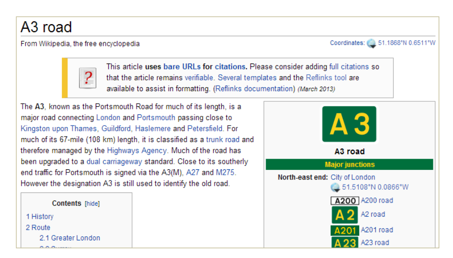
Fig. 2. Example of an article with a cleanup task that suggests users to add verifiable references to meet the quality standards of Wikipedia.

There are also domains specific properties that can be used to describe SLUA instance, as exemplified later in this paper.