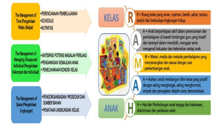
Figure 3. Child Friendly Classroom Management Model

The data obtained, and their interpretation form the basis of the argument for the importance of developing an effective classroom management model to create child-friendly classes. Based on the formulation of the concept that has been done, the researchers compiled a chart that describes the design of an effective classroom management model to create child-friendly classes. The model shows three dimensions of effective classroom management with indicators from each dimension. Each indicator will be implemented to create a child-friendly class that has five criteria. The design of the Effective Classroom Management model for Child-Friendly Classes can be seen in the chart compiled by the researcher as follows (see Figure).