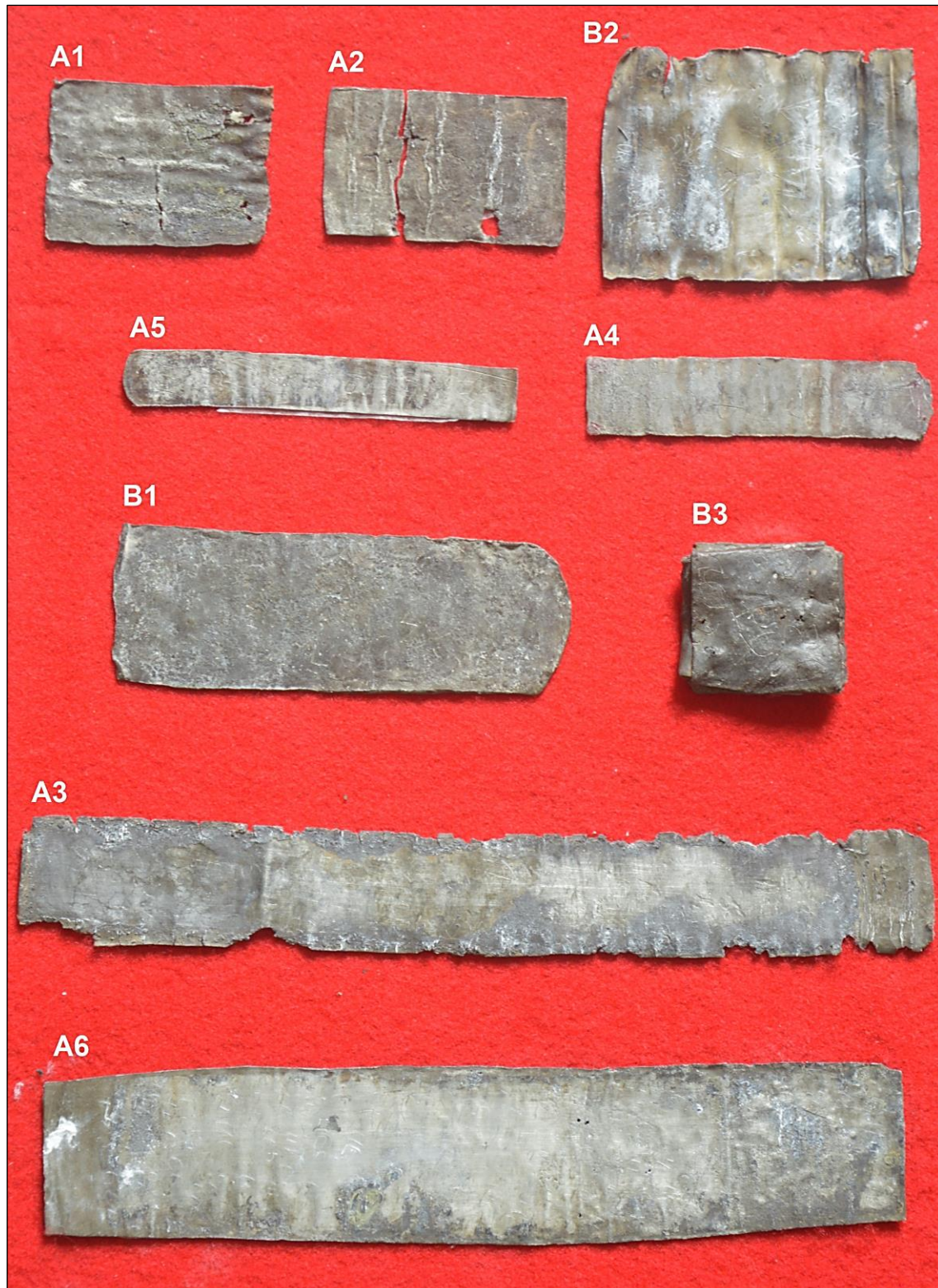
Figure 2. The tin plate inscriptions from the collection of Muntok Timah Museum

This plate inscription is mainly made of tin, rectangular in shape, measuring 6.7 cm long and 1.5 cm wide. The text is written on two sides of the plate. The following is a legible transcript of the A4 inscription: