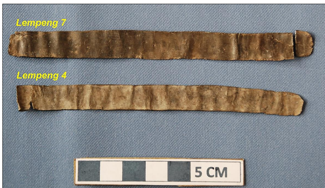
Figure 8. The collections from the BPCB Jambi tin plate inscription

Mr. Amran found the Lempeng 7 inscription near the mosque on the riverside of the Batanghari River. This plate inscription is rectangular with rounded corners and broken at the edges. This plate measures 8.5 cm long, 13.49 mm wide, 1.48 mm thick, and weighs 7.24 grams.