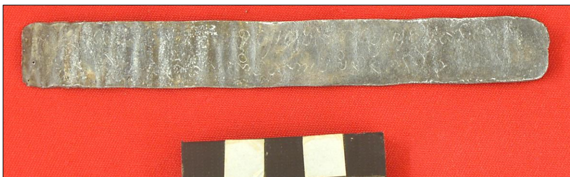
Figure 3. The Tin Plate Inscription Code SN2 from Seno's collection

This plate inscription is mainly made of tin in the shape of a rectangle measuring 13 cm long and 1.5 cm wide. The text is written on one side of the plate. The