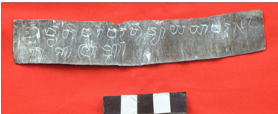
Figure 5. The RD1 tin plate inscription from Rudin's collection, Pasir Village