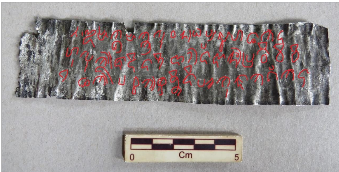
Figure 4. The Side A of The Sungai Pisang Tin Plate Inscription, which has been digitally edited

This plate inscription is mainly made of tin, rectangular in shape, measuring 14 cm long and 2.4 cm wide. The text is engraved on one side of the plate. The