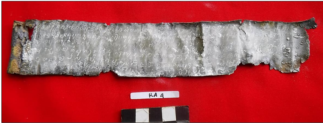
Figure 7. R4 inscription, one of Mr. Ruidiasri's collections