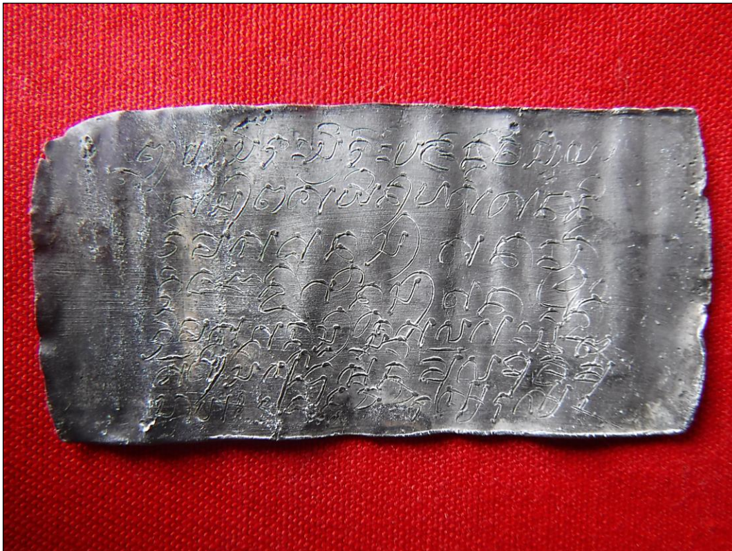
Figure 6. One of the tin plate inscriptions from the Padmasana Foundation Collection.

following is a legible transcript of the RD 2 inscription text: