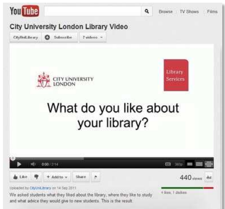
City University library video

If you've ever wanted to make a video to promote your library service or as an aid to information literacy, but didn't know where to start, here's our story from City University, London, to give you the encouragement you need.