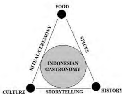
Figure 1. Triangle Concept of Indonesian Gastronomy

Lecture material is designed with a focus on the learning outcomes to be achieved. In preparing the questionnaire for the Gastronomy Nusantara lecture material, guided by the Triangle Concept, a gastronomic philosophy based on three triangular stoves. The three are, food, culture and history. Here's a picture of the concept of Indonesian gastronomy: