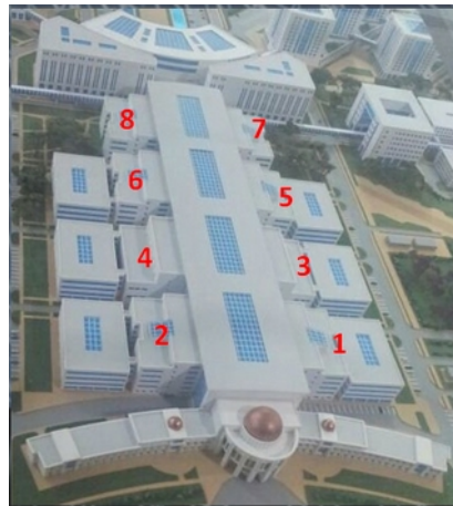
Figure 2: Schematic of the module location on the roof of NU.

The HT-KZ detector system is envisioned to have a time resolution on the order of 1-2ns using advanced electronics and data processing, and area coverage by a grid of 8 detectors approximately every 150-200 m in a rectangular shape. The location for this detector is to be at NU. Detection points will be installed at the roof-tops of the university blocks (Figure 2) with the access to network and electric power. The location of the university at about sea level does not pose a problem for the detection of EAS from so high-energy parent particle of >10^{17} eV.