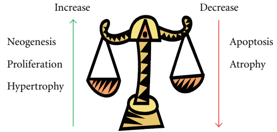
FIGURE 1: Beta-cell mass equilibrium. Beta-cell proliferation, neogenesis, and hypertrophy (enlarged cell size) increase beta-cell mass, while apoptosis and atrophy (reduced cell size) decrease beta-cell mass.

This review briefly outlines current knowledge of significant factors/nutrients regulating beta-cells mass, and their signal transduction pathways, with greater focus on postnatal regulation and the role of a new class of beta-cell mass regulators: the microRNAs.