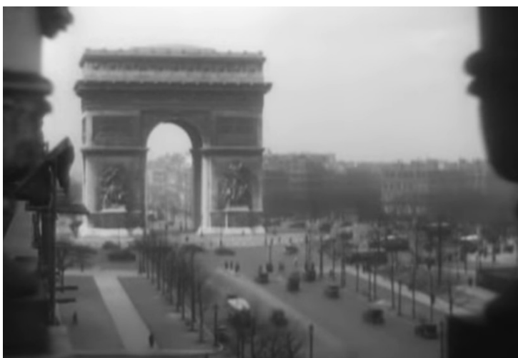
Fig. 8. Michael Curtiz, Casablanca , 1942. Still from film.