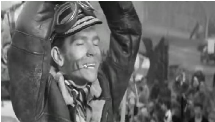
Fig. 11. John Schlesinger, Billy Liar , 1963. Still from film.

Billy Liar does not make us share the imaginative experience of Billy, just as Casablanca did not make us share the memory experience of Rick. Imaginings, indeed, usually lack the kind of accuracy, fluidity, objectivity and stability that characterizes our perceptual experience of the events imagined by Billy. Moreover, imaginative experiences, as such, should involve a feeling of unreality whatever their content whereas our experience of these scenes of Billy Liar lacks such phenomenological hallmark. The content of our perception, namely, Billy's triumph, may look weird and non-realistic but we experience it in the same way in which we experience other scenes of the film that look much more realistic. Thus, films such as Billy Liar do not make us share the imaginative states of fictional characters but only approximate to such states by providing us with perceptual experiences of nested fictional worlds.