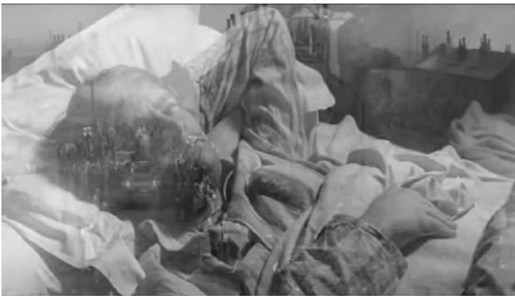
Fig. 10. John Schlesinger, Billy Liar , 1963. Still from film.