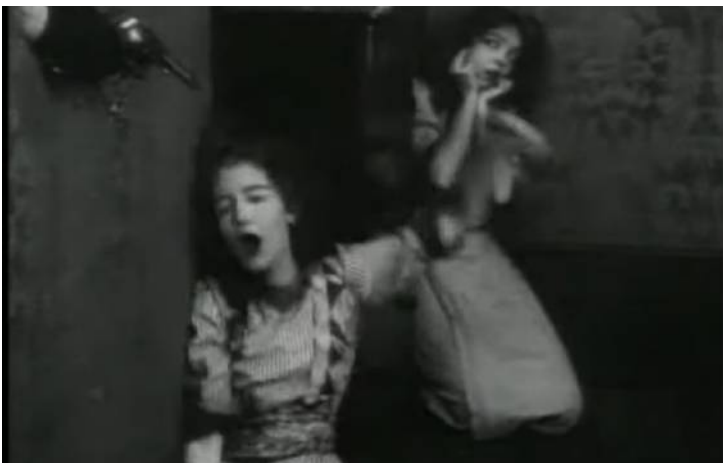
Fig. 4. David W. Griffith, An Unseen Enemy , 1912. Still from film.