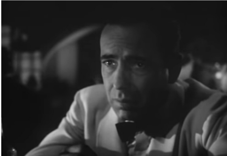
Fig. 6. Michael Curtiz, Casablanca , 1942. Still from film.

The flashback makes us perceive the events that Rick is remembering rather than his memory experience. We have not the impression of remembering those events, that is, we are not enjoying the peculiar phenomenology of memory. Rather, we keep perceiving those past events set in Paris in the same disembodied way in which we were perceiving the present events set in Casablanca which have been portrayed before the flashback.