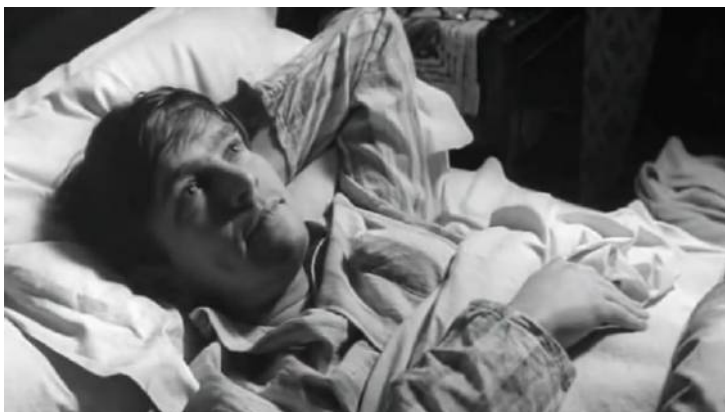
Fig. 9. John Schlesinger, Billy Liar , 1963. Still from film.

However, the way in which Billy Liar 's spectators are invited to consider Billy's imaginings is analogous to that in which Casablanca 's spectators are invited to consider Rick's memories. That is, the combination of a camera movement towards the character's face with music and visual dissolve (Figg. 9, 10 and 11). In Billy Liar , the shift to imagination is also stressed by the inner voice of Billy himself who says: "It was a big day for us. We had won the war in Ambrosia. Democracy was back once more in our beloved country...". Yet, the experience that this segment of Billy Liar elicits from its spectators remains a perceptual experience. We see Billy on a tank in the middle of the crowd which celebrates his triumph in the war. Just as Casablanca makes us perceive the events that Rick is remembering, Billy Liar makes us perceive the events that Billy is imagining. The difference is just that the events remembered belongs to the story world of Casablanca , whereas the events imagined do not belong to the story world of Billy Liar . Rather, those events belong to a nested fictional world, which the filmmaker has built up within the main fiction in order to represent Billy's imagining. 18