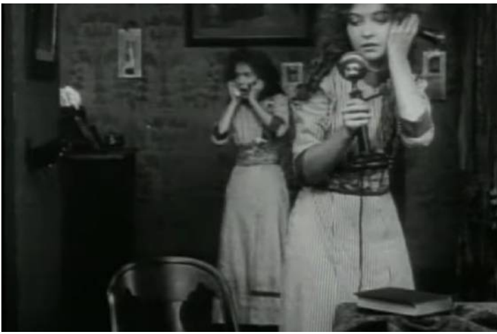
Fig. 2. David W. Griffith, An Unseen Enemy , 1912. Still from film.

She is the one who has a psychological and relational arc of transformation along the story: at the beginning she refuses reluctantly to kiss her boyfriend but in the last image of the film she finally accepts the kiss. It is tempting to see the film as a sort of bildungsroman of this girl; specifically, her initiation to sexuality. This hermeneutic temptation is encouraged by the subjective shot in which the gun passing through the hole evokes a sort of phallic figure. The next shot shows that the girl is horrified by the gun. Later in the story, however, she finds the courage to try to grasp the gun, and then slumps back (Fig. 3 and 4).