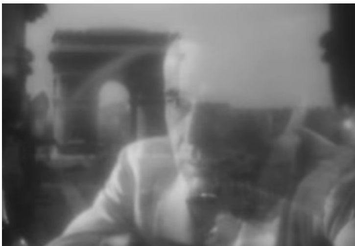
Fig. 7. Michael Curtiz, Casablanca , 1942. Still from film.