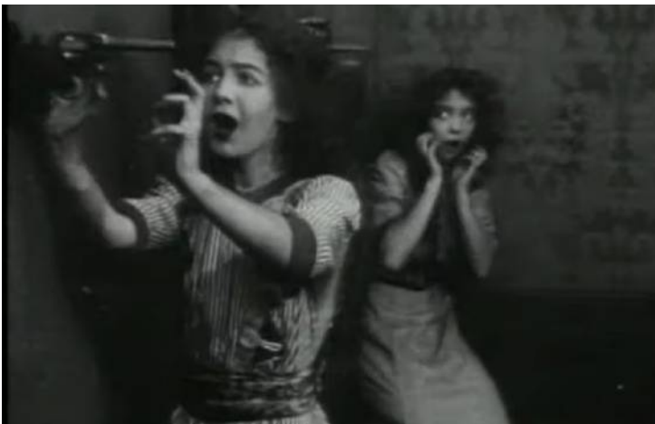
Fig. 3. David W. Griffith, An Unseen Enemy , 1912. Still from film.

She is the one who has a psychological and relational arc of transformation along the story: at the beginning she refuses reluctantly to kiss her boyfriend but in the last image of the film she finally accepts the kiss. It is tempting to see the film as a sort of bildungsroman of this girl; specifically, her initiation to sexuality. This hermeneutic temptation is encouraged by the subjective shot in which the gun passing through the hole evokes a sort of phallic figure. The next shot shows that the girl is horrified by the gun. Later in the story, however, she finds the courage to try to grasp the gun, and then slumps back (Fig. 3 and 4).