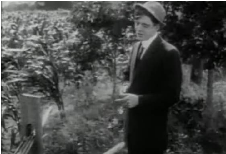
Fig. 5. David W. Griffith, An Unseen Enemy , 1912. Still from film.

Interestingly, the editing connects this image of the girl to the image of her boyfriend walking in the fields (Fig. 5).