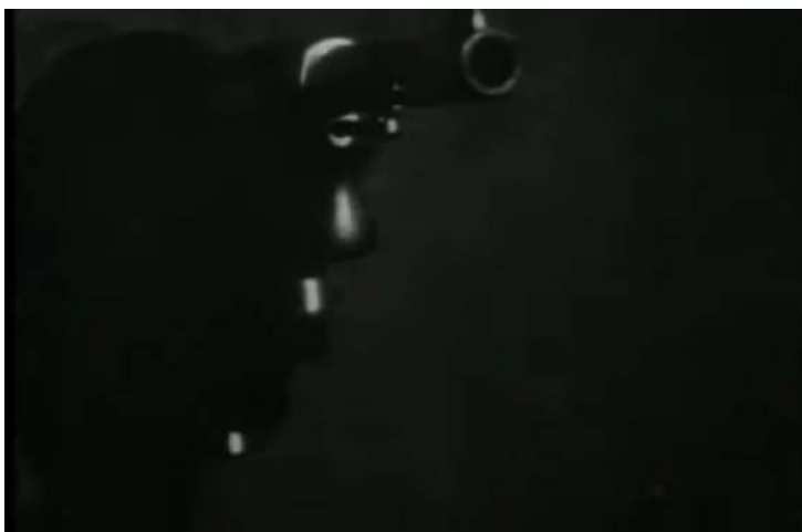
Fig. 1. David W. Griffith, An Unseen Enemy , 1912. Still from film.

In fact, more cautious and parsimonious uses of the subjective shot can have outstanding aesthetic effects. Griffith’s An Unseen Enemy is exemplary in this respect. I pointed out earlier that the film is based on “objective” shots from neutral standpoints that are aimed to elicit pure disembodied experiences from the audience. Yet, quite exceptionally, one subjective shot emphasizes the most dramatic passage of the story. This shot is a close-up of the gun that the housekeeper passes through a hole in the door of the room where the two sisters took refuge (Fig. 1). We see the gun from the standpoint of the younger sister (Fig. 2), and this subjective shot emphasizes the centrality of that character in the narrative.