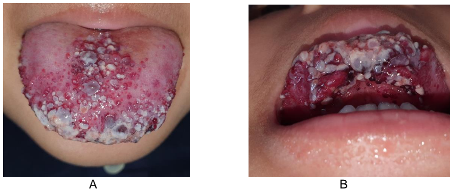
Figure 1. Clinical presentation in first visit (A) Dorsal surface of the tongue, (B) Ventral surface of the tongue; multiple white, clear liquid and dark reddish vesicles, covering two-thirds of dorsal surface and some parts of ventral surface of the tongue.

Intraoral examination showed non-scrapable multiple white and dark reddish vesicles, which covered two-thirds of dorsal surface and some parts of ventral surface of the tongue (Figure 1).