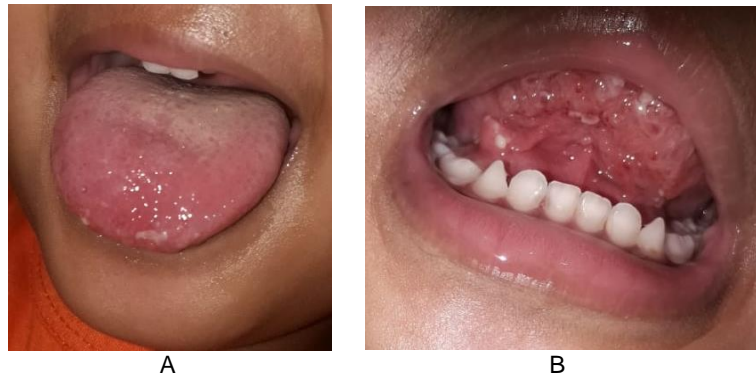
Figure 4. Clinical presentation during observation showed further improvement, with only very few white vesicles on the dorsal and ventral surface of the tongue.