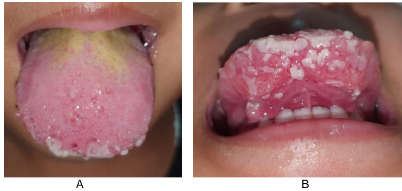
Gambar 2. Clinical presentation in second visit (A) Dorsal surface of the tongue, (B) Ventral surface of the tongue; significant improvement in both areas affected

Diagnostic examination, namely ultrasonography, supported the MLM diagnosis, thus eliminating the hemangioma differential