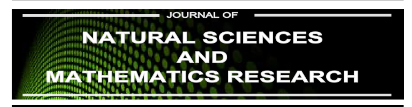
Available online at http://journal.walisongo.ac.id/index.php/jnsmr