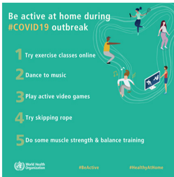
Figure 1. Be Active at Home during #COVID19 Outbreak

namely maintaining health by always being active at home during the Covid-19 outbreak. The semiotic process of signs in the poster is divided into three types, namely iconic, indexical, and symbolic meanings.