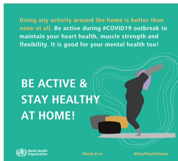
Figure 2. Be active & stay healthy at home!

Pragmatic analysis was used to examine verbal data using the Speech Act framework from Searle (2005) and the direct speech act and indirect speech act from Yule (1996). The text "Be active at home during #COVID19 outbreak!" is a poster title in the form of an imperative with directive illocutionary power so that it is categorized as a direct speech act. The following sentences, namely "Try exercise classes online", "Dance to music", "Play active video games", "Try skipping rope", and "Do some muscle strength & balance training" are also imperative with directive illocutionary power so that they are categorized as a direct speech act.