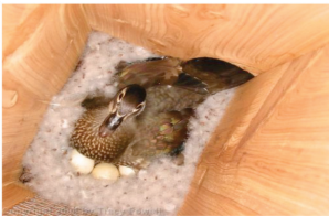
(d) Active incubation/laying (female, eggs, down)