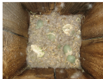
Figure 2. Examples of cues available in (A) Wood Duck nests and (B) Common Goldeneye nests after nesting. A: Wood Duck nests showing various stages of nesting, from not used (a) through to failed (f). B: Common Goldeneye nests showing two different examples of successful nests.