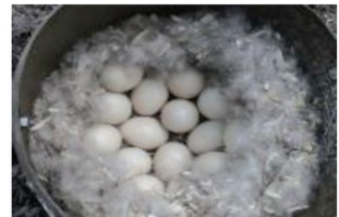
(c) Active incubation (down, eggs covered)