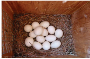
(b) Abandoned or laying (no down)