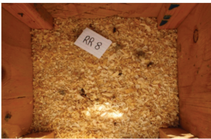
(a) Not used (shavings, undisturbed)