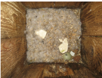
(a) Successful hatch (7 ducklings hatched and left the nest)