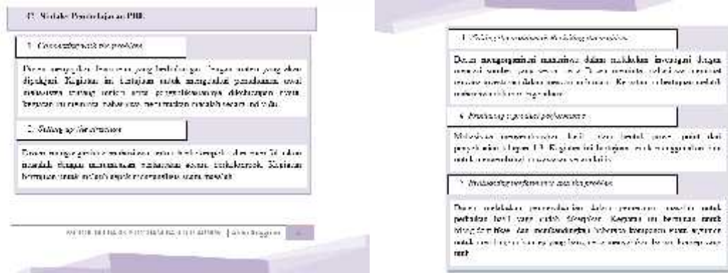
Figure 2 Syntax of integrated PBL learning in the module

The advantages of PBL-based e- modules include (1) the material on the PBL-based e-module which was developed based on the results of research on the potential of purple sweet potato in rats hyperglycemic on hormone leptin levels in rats, (2) PBL-based e- module material besides being based on The results of the research are taken from various references to the endocrine system of the leptin hormone, (3) the content of the e- module material refers to subject learning outcomes (CPMK), (4) the e-module contains PBL syntax in LKM, so that students are trained to solve problems using e-PBL based e-module (Rahmatika et al., 2020), (5) PBL based e-module equipped with answer keys, scores and descriptors, and self-assessments (Warsono & Hariyanto, 2013), (6) The resulting e-module is valid and practical (Fonda & Sumargiyani, 2018; Imansari & Suryaningsih, 2017; Irwansyah et al., 2017). The shortcomings of the PBL based e-module include, 1) the PBL based e-module only discusses the material of the leptin hormone, not yet accommodating the whole endocrinology material, 2) Various pictures displayed in the e-module are still sourced from other sources (Morrison & Ross, 2004).