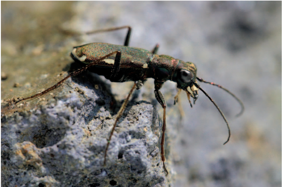
Figure 4. Cylindera germanica

high number of carabid species, each with specific demands, makes it difficult to define a single conservation strategy. Protection of whole landscapes with mosaics of distinct habitat types may prove efficient for carabid conservation. Simultaneously, the natural variety of successional stages should be conserved, as particular stages can be crucial for certain species (cf. Niemelä et al. 2007). Moreover, some species – such as Amara plebeja (van Huizen 1977) – possibly require more than just one habitat type and/or successional stage to persist in a landscape ('landscape species'; Szyszko 2004; Szyszko et al. 2011; Axel Schwerk, pers. comm.). Habitat patches within these mosaics should include particular structures, such as micro-relief, patches of bare sand, stony patches, small water bodies, heaps of decaying plant material, and dead wood, features that are often of no special importance for plants and vertebrates and therefore often ignored if conservation management is based on vegetation data alone. Thus, a broad landscape approach, supplemented by these small-scale structures, may produce good results for the conservation of carabid beetles (Kirby 1992; New 1995, 2010; Samways 2005, 2007; Haslett 2007).