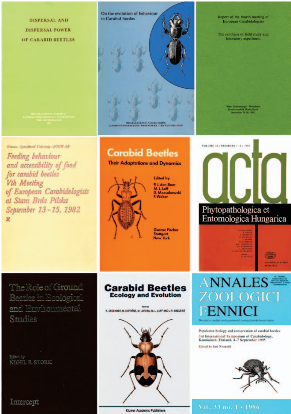
Figure 1b. Front covers of the first European meetings, ECM 1–8 and that of Hamburg 1984 (centre cover) (see also Table 2).