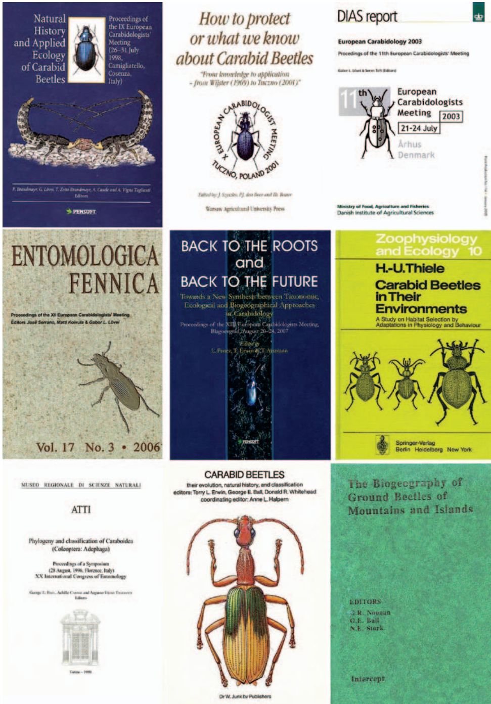
Figure 1c. Front covers of the last five ECMs and of a few major carabidology publications (Thiele 1977; Ball et al. 1998; Erwin et al. 1979; Noonan et al. 1992) (see also Table 2).