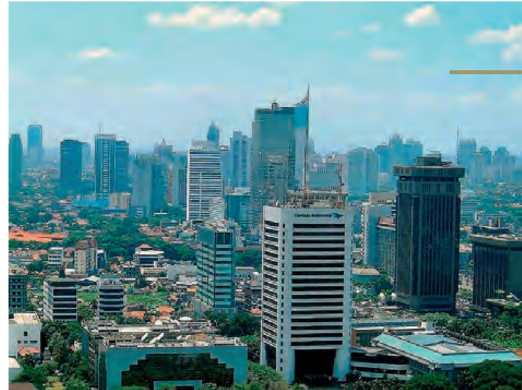
Photo 2. Most of the world's population growth in coming decades will be in towns and cities, predominantly in the developing world. By 2025, out of the projected 27 megacities with over 10 million people, 15 will be located in Asia.

Photo 3. It is estimated that almost 75 percent of the wood produced in Asia is burned for fuel by households and small-scale enterprises. In South Asia, fuelwood accounts for 93 percent of total wood production, while in Southeast Asia, its share in total wood production is 72 percent. Subsistence consumption is high and alternative fuels are not commonly available at affordable prices.