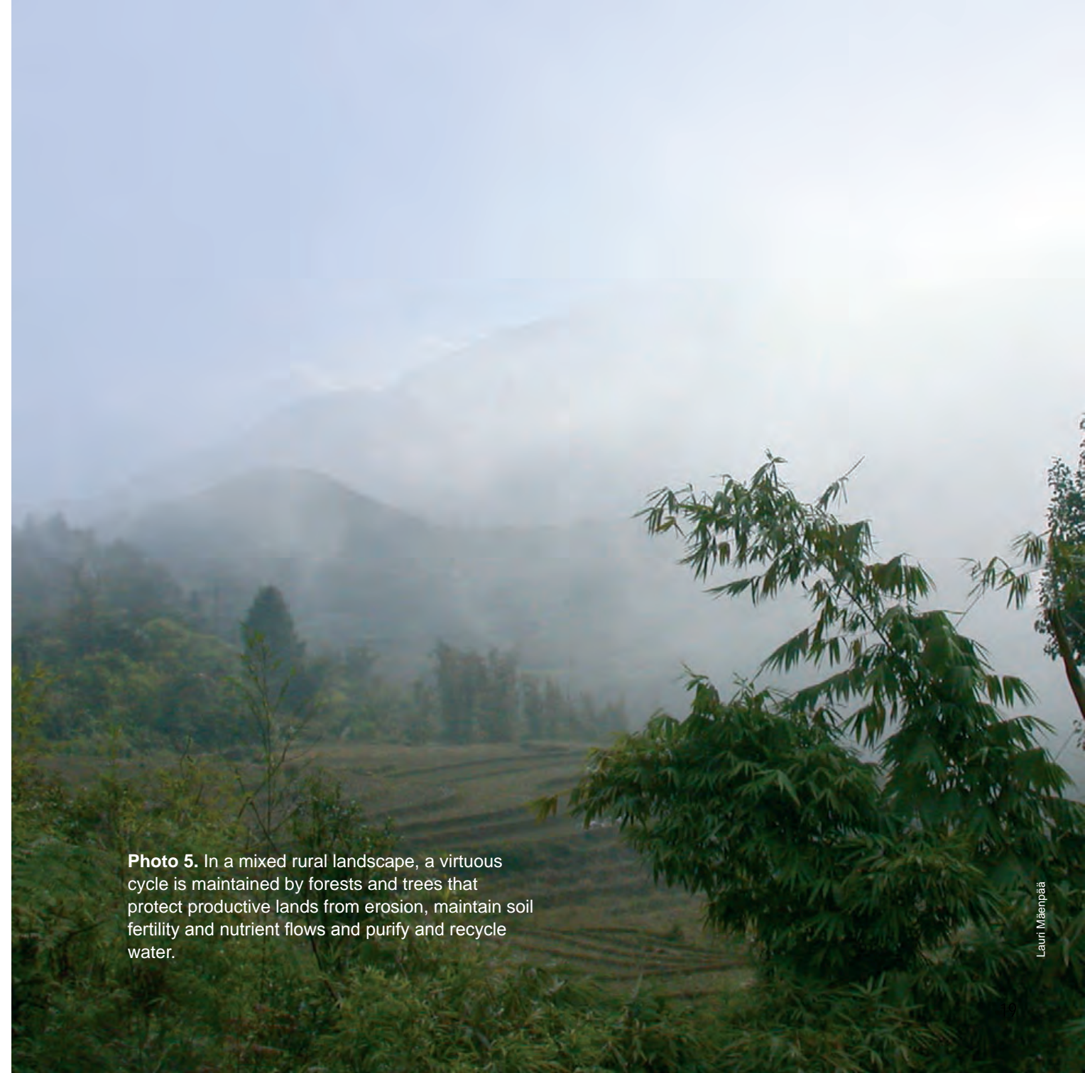
Photo 5. In a mixed rural landscape, a virtuous cycle is maintained by forests and trees that protect productive lands from erosion, maintain soil fertility and nutrient flows and purify and recycle water.