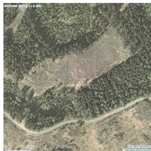
Fig 1. Aerial image of block 3 of the Längelmäki experiment with the clear-cut treatments in the middle of the figure. The control forest is on the right side of the clear-cut area.

The aim of this study was to quantify soil CO 2 effluxes from clear-cut boreal forests managed in different ways after clear-cutting.