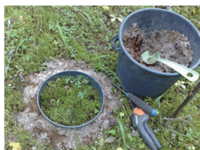
Fig. 2. An undisturbed microsite prepared for soil respiration measurement.